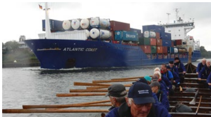
Nydam Tveir on its way down the Kiel Canal to reconquer East Anglia.

On the evening of Tuesday 17 June 2014, we left our safe haven, and eight tons of boat and crew rowed out to sea - Nydam Tveir 's maiden voyage. The boat handled well, with the crew trying hard to keep stroke - practise makes perfect. After stability tests, two tons of stone ballast had been put into the bottom of the ship, so it moved steadily through the water, responding well to the rudder. Next, we have to learn how to sail it, and test its performance.