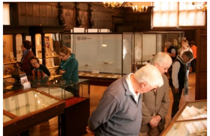
In the Anglo-Saxon section of Maidstone Museum, to see a temporary display of the recent small finds from Lyminge.