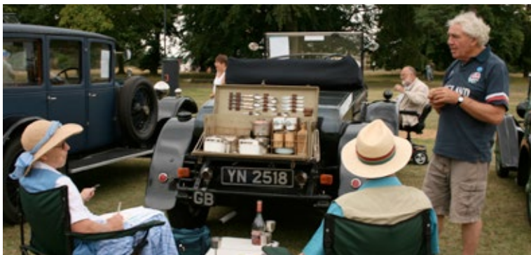
That's the way to do it: a 1930s picnic