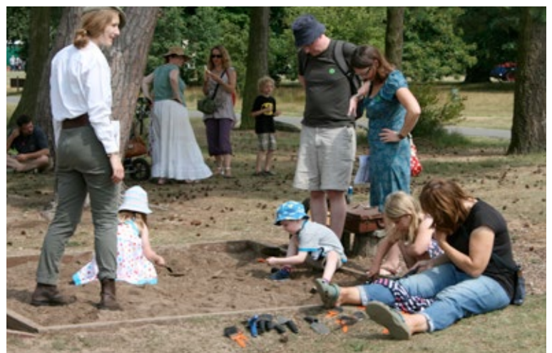
Training a future generation of Basil Browns.