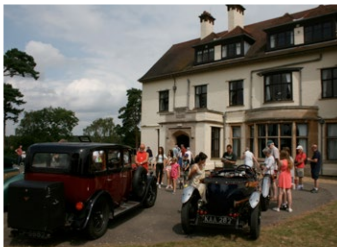
Tranmer House, formerly Mrs Pretty's home, was the centre of many of the weekend's activities.