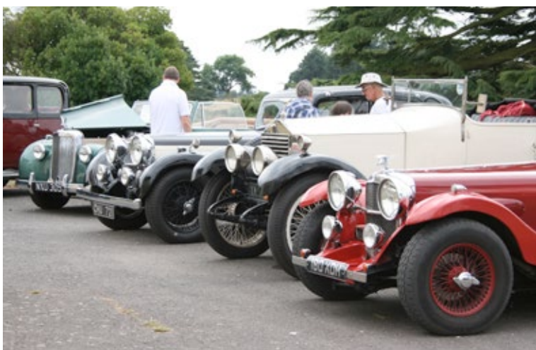
A fine line-up of classic cars delighted visitors on Sunday.