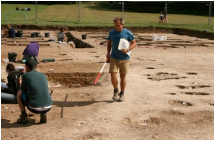
Walking the 20 metre-diameter Bronze Age ring ditch, which was partly overlaid by a series of 6th century timber halls and adjacent to 'the blob' (background).