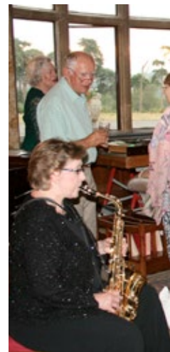
The jazz ensemble Sax Affair.