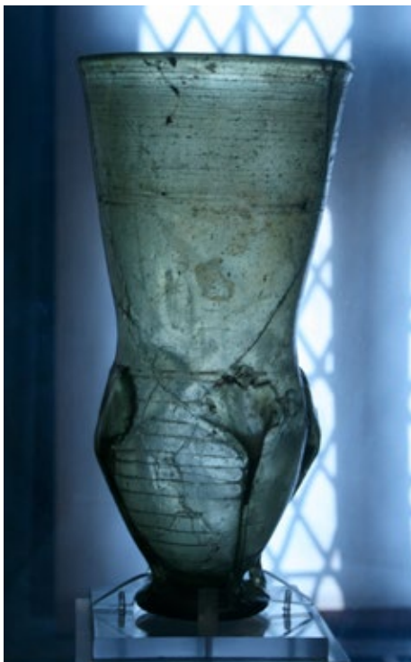
The 7th century Faversham claw beaker in the collection at Maidstone Museum.