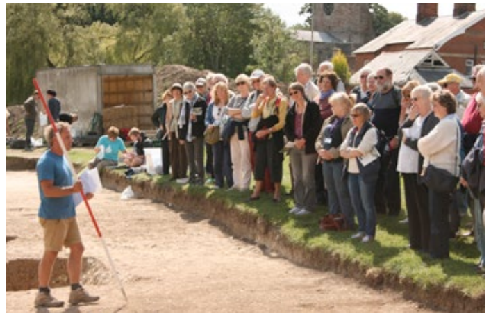
Full coach, full attention: members of the Society listen to the dig director.