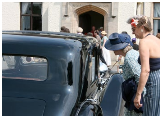
"If only this was ours!"