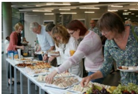
Ah, lunch!