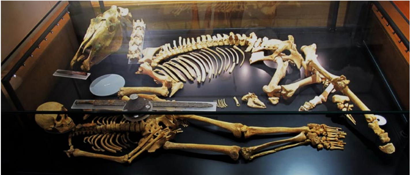
The Lakenheath Warrior, with sword, shield boss and horse, lies in its new display in Mildenhall Museum.