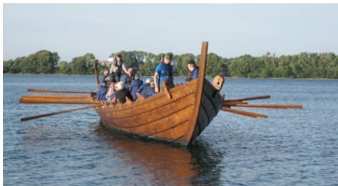
Nydam Tveir on its maiden voyage.