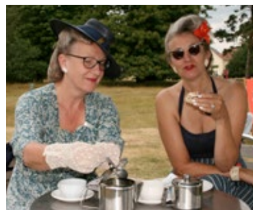
Two of the performers stay in character for a tea break.