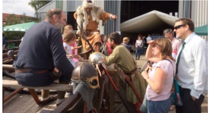
A thousand questions around Sae Wylfing in Whisstocks former shipyard. (Peter Bradbeer)

Surrounded by other craft elegantly dressed in polished varnish, gleaming spars and crisp, cream canvas, Sae Wylfing was surely Cinderella, with her black planks smelling of linseed oil, but the visitors loved her sweeping lines and wanted to hear her story. The sheer scale of the full size ship was something that most people struggled to visualise, at twice the length of Sae Wylfing and eight times the volume.