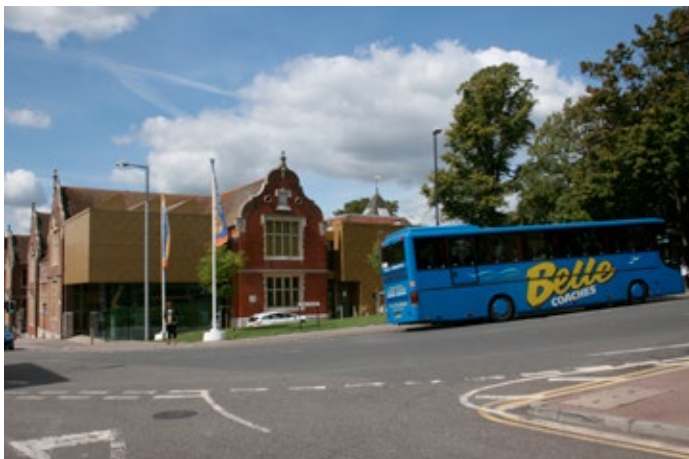
After leaving Sutton Hoo at 8am and over two hours on the motorway, first stop was Maidstone Museum.

a midden of charcoal, animal bone and a seemingly inexhaustable series of Anglo-Saxon small finds, more than three metres deep: 1.4 metres had to be left unexcavated at the end of the dig. There were more than 200 sherds of glass, diagnostically significant detritus from iron and copper working, smashed Anglo-Saxon pots and butchered beef. A nearby transect was excavated down to a laid flint platform, identified as late Roman, but of unknown function. The significance lies in the clear archaeological association of Roman with early Anglo-Saxon occupation.