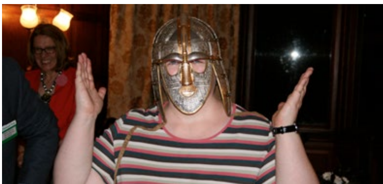
Therese Coffey tries it on.