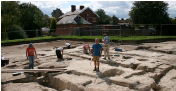
Pointing out the post holes and trenches of the hall discovered in 2012 in another square.