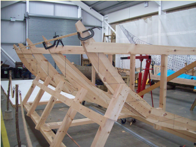
Making a frame to create a midship model of the hull. This will help establish the rowing positions and the length of the oars.