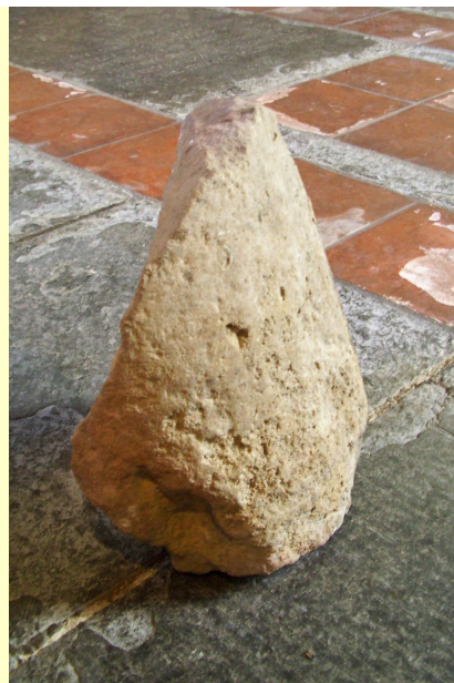
The column fragment.