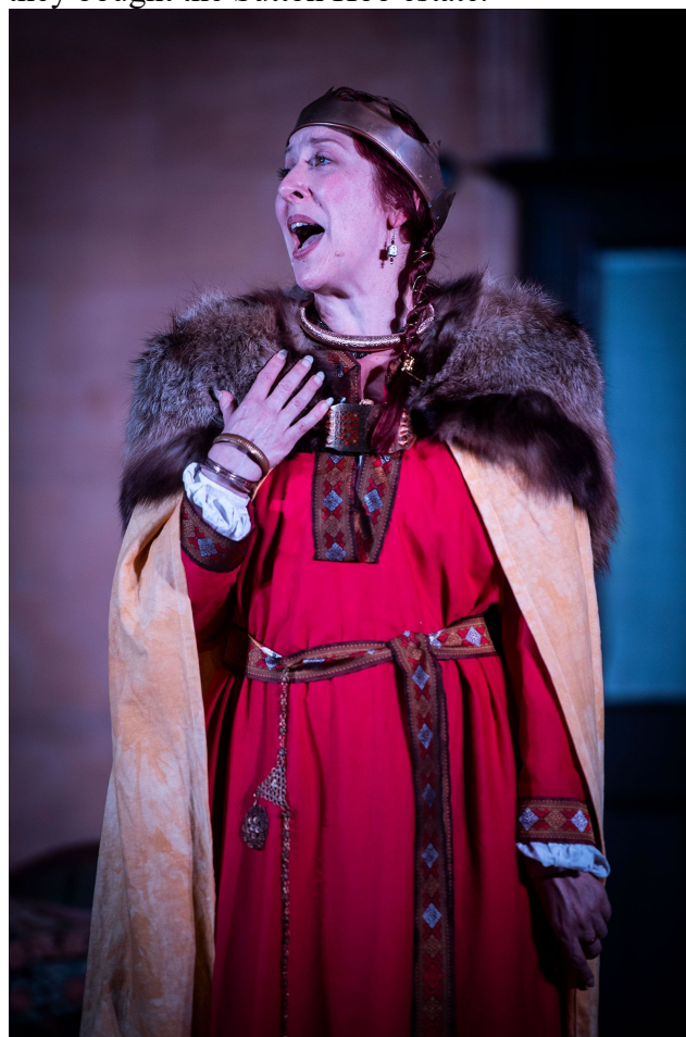
Rædwald's queen.