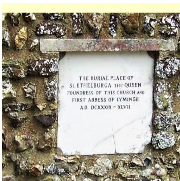
A plaque in the south wall of the present church of St Mary and St Ethelburga, Lyminge.

In April 2019 the Sutton Hoo Society received an application for funding towards undertaking the re-excavation of the remains of one of England’s early Anglo-Saxon stone churches in the churchyard of St Mary and St Ethelburga church, Lyminge. This was planned as part of a much larger community-based project called Pathways to the Past: Exploring the legacy of Æthelburh , which was being carried out by the church council. The early church with a nunnery is recorded as being founded at Lyminge by Æthelburh, a princess of Kent and Queen of Northumbria in the seventh century.