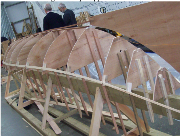
Making a 1/5th scale model to interpret the 1400-year-old plan and provide information for the main build.

The Ship's Company has been making progress towards making the ship happen: