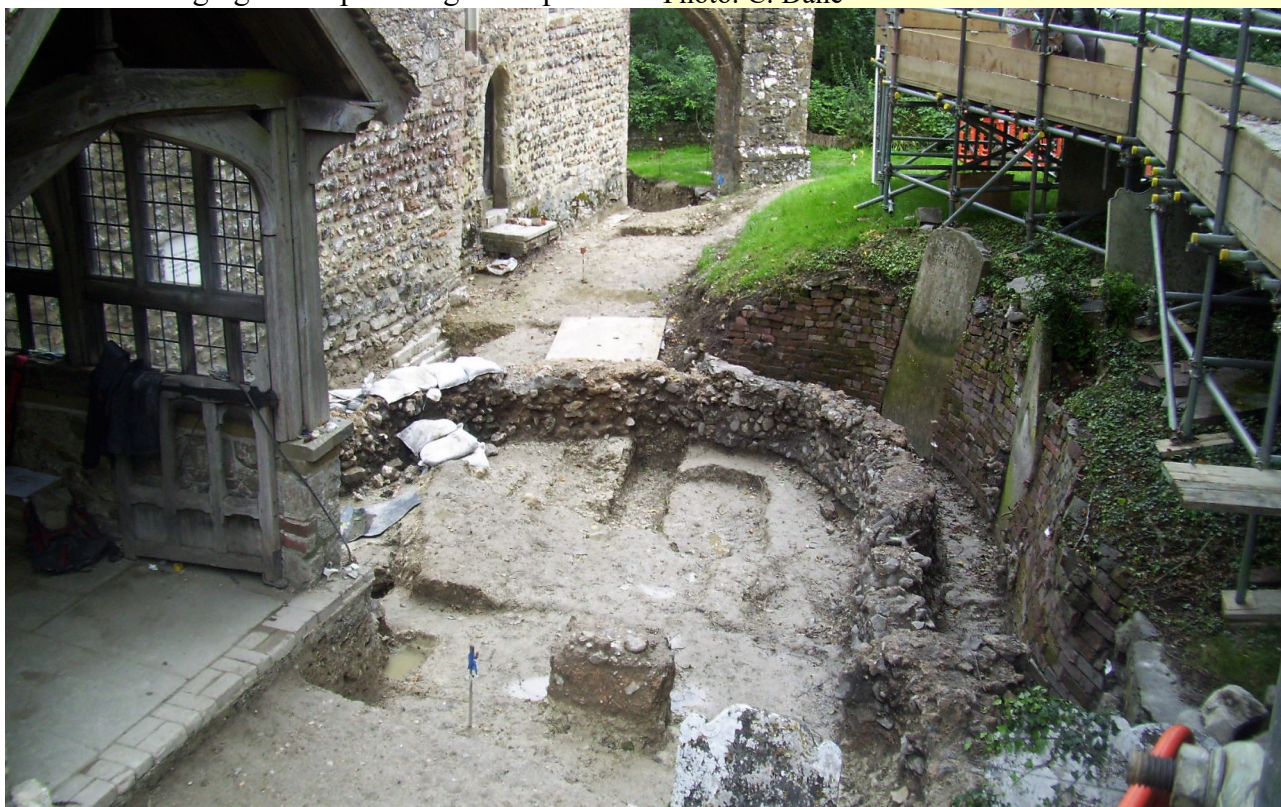
A view across the interior of the nave towards the apse. One of the pier foundations of the triple arcade is visible in the centre foreground (behind the gravestone).